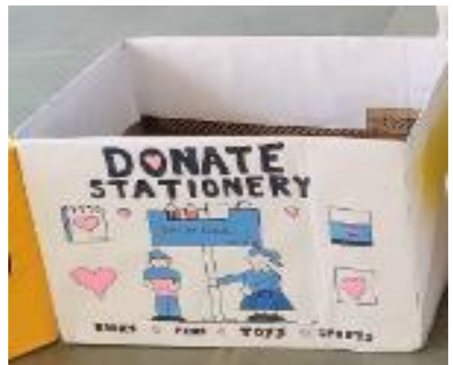
Fig1 & Fig2 : Donation Box prepared by creative members