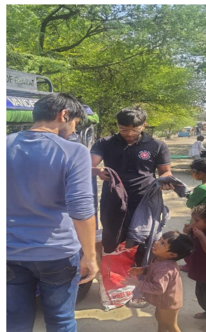
Fig4 Fig5 Fig6 : Went to a slum (Kashmere Gate) with clothes and blankets and distributed clothes among the children or families