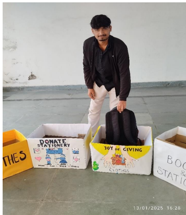
Fig3 : Community members are giving first donation